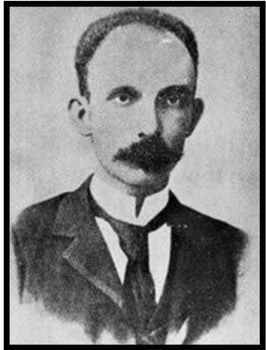
JOSE JULIAN MARTI [1853-1895]

Abraham Lincoln was one of the truly great men of all time. He preserved the American Union during the Civil War and proved to the world that democracy can be a lasting form of government. Lincoln's "Gettysburg Address" and many of his other speeches and writings are classic statements of democratic beliefs and goals. Lincoln was the first President elected by the Republican Party. His great asset was his ability to express his convictions so clearly, and with such force, that millions of his countrymen made them their own. His great source of strength was his iron will. Life in the United States during Lincoln's administration revolved almost entirely around the Civil War. To raise money to fight the war, Congress levied the first income tax in the history of the country. An assassin's bullet ended this great man's life in 1865.